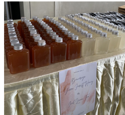
HOMEMADE DRINK @ $2.50 ($2.725/ INCLUSIVE OF GST) 300ml (Yuzu Honey/ Iced Lemon Tea/Water Chestnut)