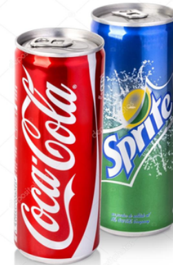
CANNED DRINK @ $1.50 ($1.635/ INCLUSIVE OF GST) 320ml (Coke/ Sprite/ Iced Lemon Tea)