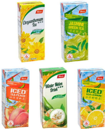
ASSORTED PACKET DRINK (250ML) / BOTTLED WATER (500ML) @ $1.00 ($1.09/ INCLUSIVE OF GST)