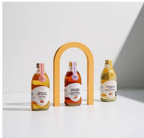
GRYPHON COLD BREW TEA @ $6.50 ($7.085/ INCLUSIVE OF GST) 300ml (Assorted flavors)