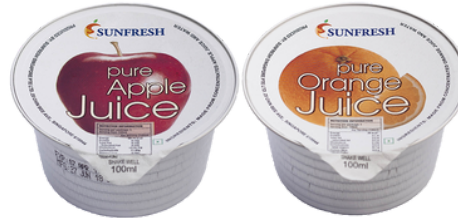
FRESH JUICE CUP @ $1.00 ($1.09/ INCLUSIVE OF GST) 100ml (Apple/ Orange)