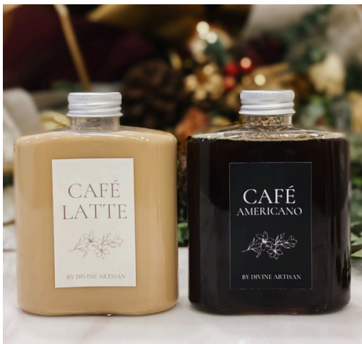
ARTISANAL COLD BREW @ $6.50 ($7.085/ INCLUSIVE OF GST) 300ml (Americano / Latte/ Hojicha/ Matcha)